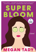
SUPER BLOOM BY MEGAN TADY

With summer upon us, BEACH READING SEASON is in full swing. From blazing thrillers and captivating debuts to a tale of survival and reinvention, these six novels are not to be missed. BY EMILY LIEBERT