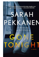
GONE TONIGHT BY SARAH PEKKANEN

It's 1970s Los Angeles and Evra Scott is the daughter of an Oscar-winning director and a Brazilian bombshell actress. By day, Evra helms Sunset on Sunset , the store worshiped by Hollywood's young elite. By night, she's on the arm of Hawaii's hottest export, Kai de la Faire, the "it" screenwriter. Then there's Theodora Leigh, a twenty-something Paramount assistant who's leading lady material, but prefers to operate as a movie producer. Before long, Theodora's drive ignites an intense quest for power in an industry that's as glitzy as it is deceitful.